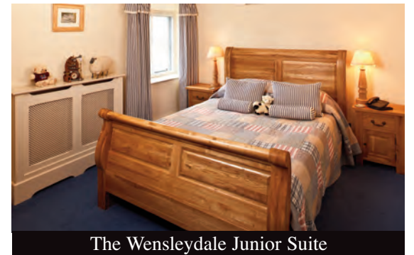
The Wensleydale Junior Suite