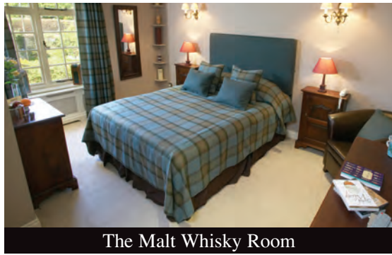
The Malt Whisky Room