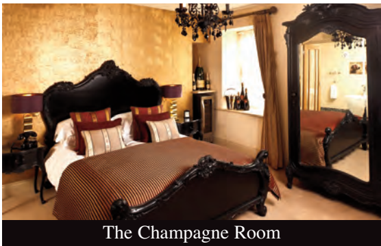
The Champagne Room