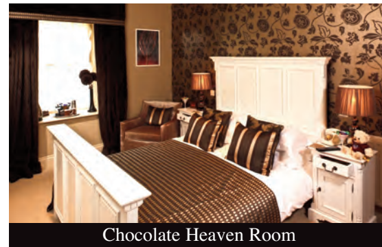
Chocolate Heaven Room