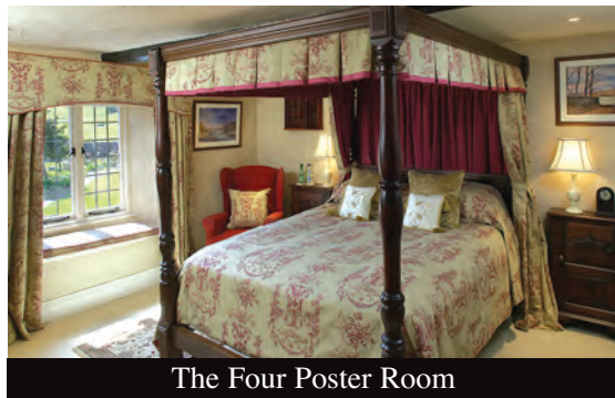
The Four Poster Room