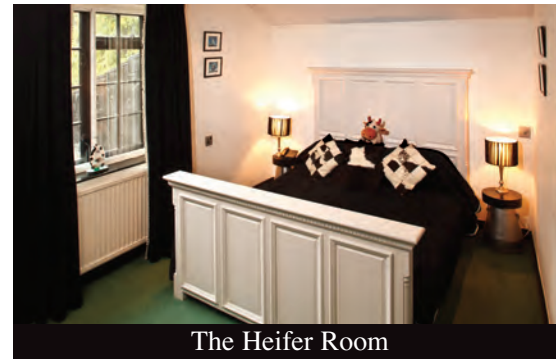
The Heifer Room