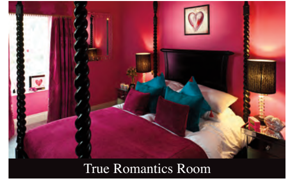
True Romantics Room