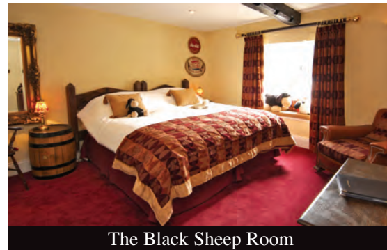
The Black Sheep Room