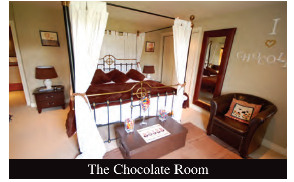
The Chocolate Room