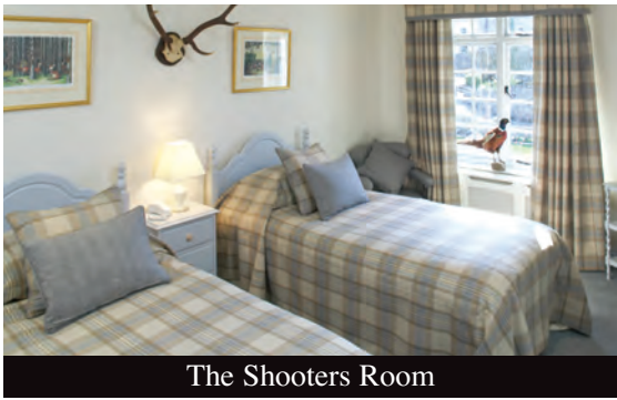
The Shooters Room