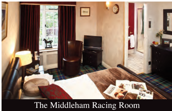
The Middleham Racing Room