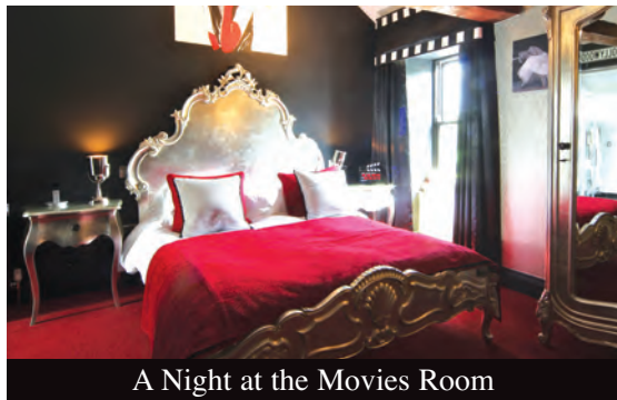
A Night at the Movies Room